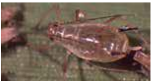
Figure 4. English grain aphid