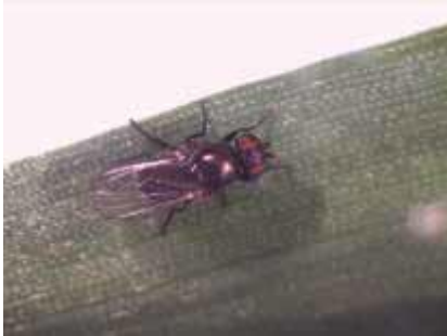
Figure 6. Adult leaf miner fly