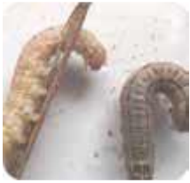
Figure 9. False armyworm larva