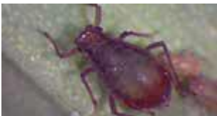
Figure 3. Oat aphid

When concerned about normal aphid feeding damage, chemical control can be applied between flag leaf appearance (GS14) and full ear emergence (GS17) when 20 to 30% of tillers are infested with 5-10 aphids per tiller. However, when you are aware of the presence of BYDV in your area, preventative spraying may be conducted at an early stage to prevent virus transmission by aphids arriving early. ARC-Small Grain is currently monitoring migrating aphid numbers using 12m high suction traps in some of the irrigation areas. Data are presented on a weekly basis on the ARC-Small Grain website to inform farmers about the status of aphid numbers present at critical times.