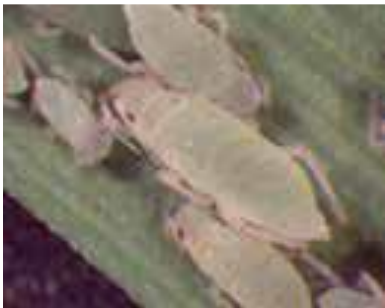
Figure 1. Russian wheat aphid

Host plant resistance has been the best control option for RWA since the release of the first RWA-resistant cultivar (Tugela-DN) in 1992 and it is recommended to still plant cultivars with resistance. Producers should monitor fields regularly and be aware that it may be necessary to apply insecticides if aphid populations increase.