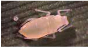
Figure 5. Rose grain aphid

(Follow the link http://www.arc.agric.za/arc-sgi/Pages/2017-Aphid-numbers.aspx .)