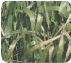
Figure 7. The mined portion of the wheat leaf which turned brown