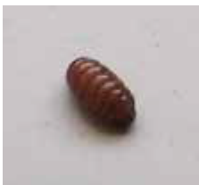
Figure 8. Leaf miner pupae