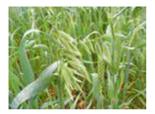
Figure 5. Avena plant

producing areas of the Free State, especially in monoculture wheat production. The seed of wild oats usually gets distributed through contaminated wheat seed and contaminated machinery. (Fig. 6). Post-emergence herbicides are applied after the weed and/or crop has emerged from the soil. Several herbicides are registered for the control of wild oats in wheat Table 3). Please follow the specific instructions and dosage recommendations on the chosen products label. Always consult the label before spraying any herbicide.