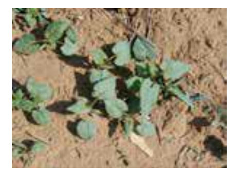
Figure 1. Wild buckwheat seedling

relatively tolerant to some herbicides, especially hormone-type herbicides. Several herbicides are registered for use on this weed (Table 1). As with all herbicides, please follow the instructions and dosage recommendations on the label.