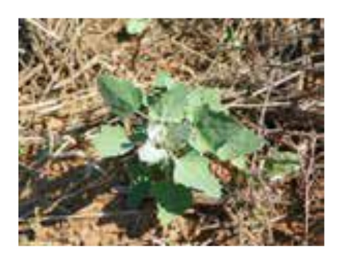
Figure 3. Young Chenopodium plant

seedling stage. (Fig. 4). The most effective way to control this weed is by using herbicides. Several herbicides are registered for use on this weed (Table 2). Follow the instructions and dosage recommendations on the label. Be aware that green goosefoot is also a Chenopodium spp. (C. carinatum) and while most of the herbicides listed in Table 2 will control green goosefoot, it is still necessary to make sure which Chenopodium spp. is indicated on the herbicide label.